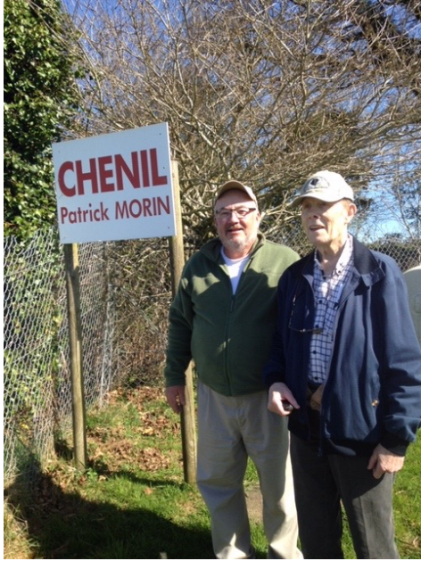
At a 2017 visit to Keranlouan